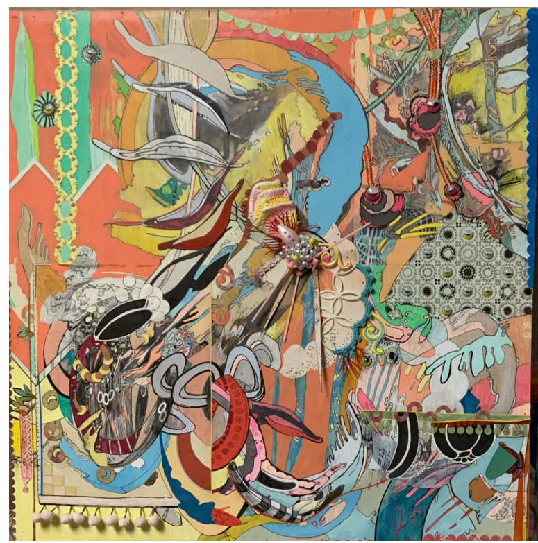
'With Love, from the Plantsman,' located outside the Sanctuary.

In explaining her work the artist notes that, "Collage pushes the additive and subtractive aspects of the artistic process — it is additive as elements are glued onto the surface and, conversely,